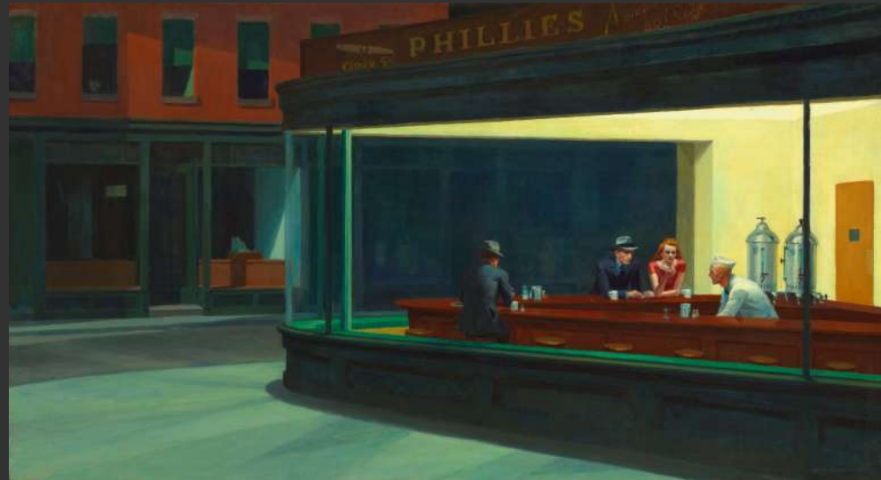
Hopper, Nighthawks , 1942